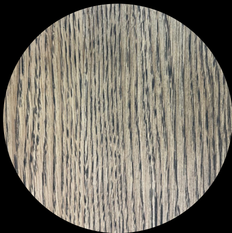
OAK - BLACK COFFEE

Protects and colours in one single application.