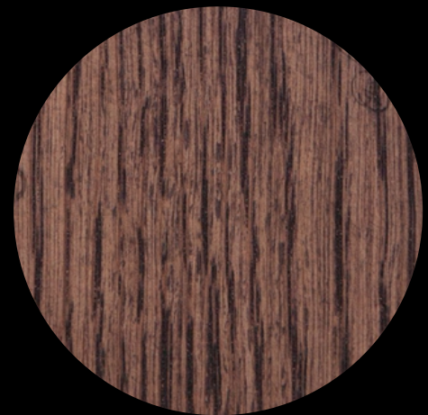
OAK - MAHOGANY