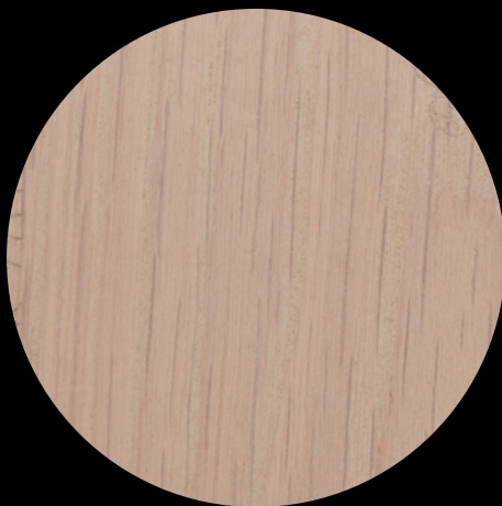
OAK - WHEAT