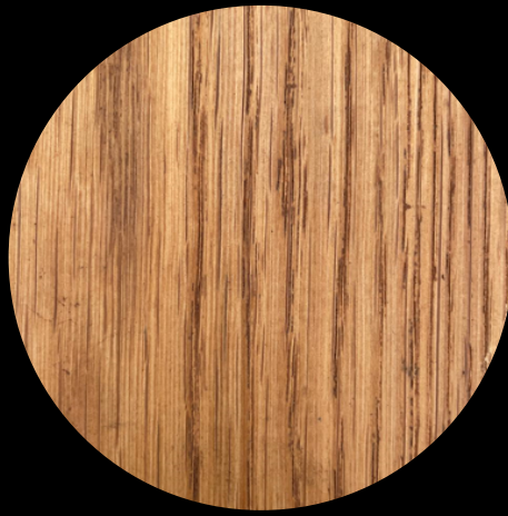
OAK - ANTIQUE BROWN