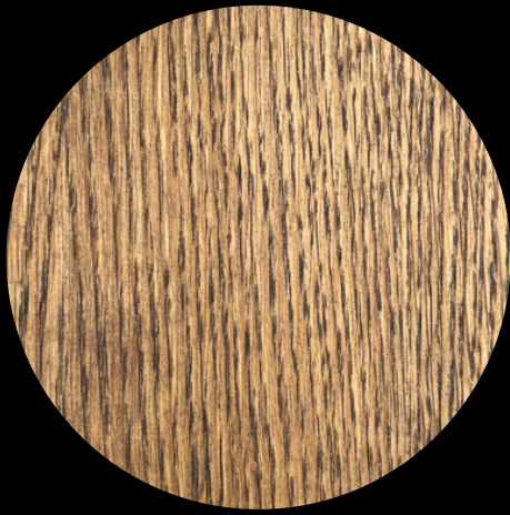
OAK - VINTAGE BROWN