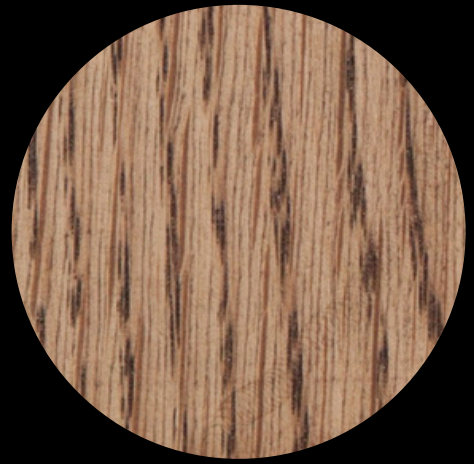
OAK - WALNUT