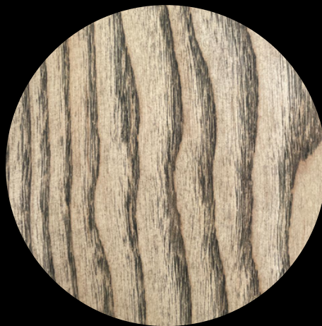
OAK - ASH GREY