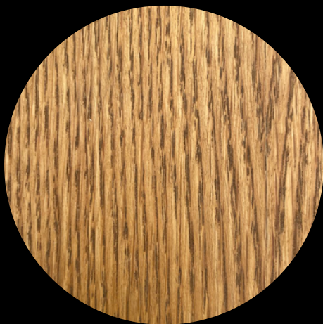
OAK - CAPPUCCINO