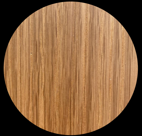
OAK - NATURAL

Contact us for any custom colour requirements.