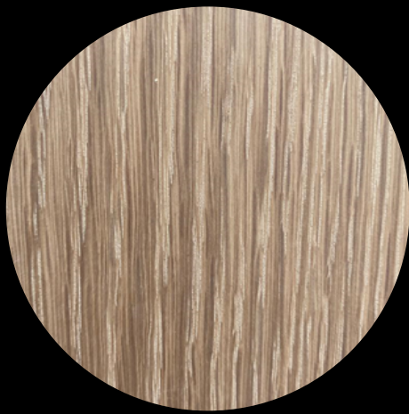
OAK - 5% WHITE